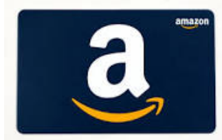
$200 Amazon Gift Card