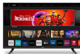
32" Smartcast TV