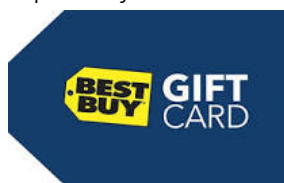
$200 Best Buy Gift Card

**1 prize may be chosen for every $2,500 sold.