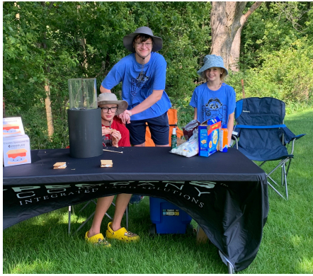
S'mores makers for golf teams

Wow! What an incredible day we had for the Scouting Golf Classic on July 15th! 34 teams joined us on the course on one of the hottest days of the year, made it into the clubhouse before the storms started, then stayed with us through a blackout while still supporting Scouting through a live auction!