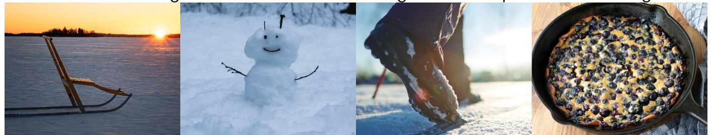
*Ice skating pending the weather to safely walk on the Mississippi River.

Bundle up tighter than a burrito because it's time to brave the elements! Grab your coziest coat, a hat, gloves, and slap those plastic bags over your socks—it's a winter wonderland out there! Calling all 4th and 5th graders, plus Scouts BSA youth: join us for the frosty fun of the Klondike Olympics on January 11th ! Get ready to put your ice-skating skills, snowball prowess, and dessert-making magic to the ultimate test while building some epic team spirit. It's only $8 per Scout and don't forget to bring a can of clear or tomato based soup to fuel your adventures! Cub Scouts - Register as a Den. Scouts BSA - register as a troop! at Scoutslowa.Org