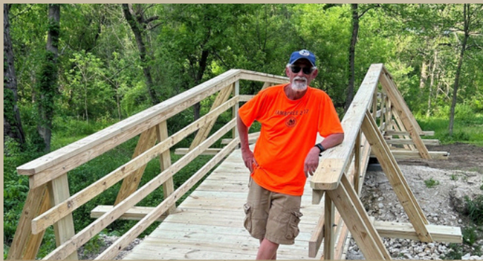
George "Dave" Scofield Bridge