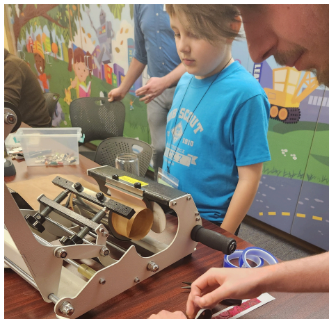
Learning about how ink transfers with heat, how to 3D print and all the S.T.E.A.M. adventures at the Carnegie-Stout Library!