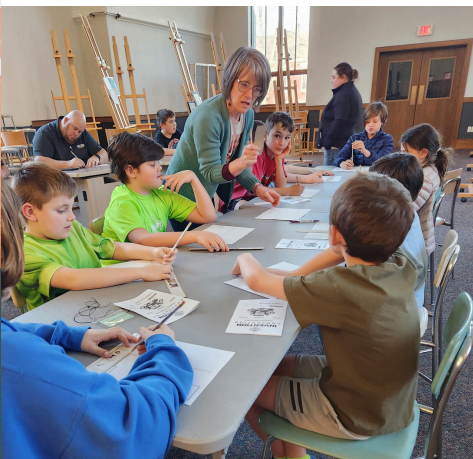
Scouts participate in learning about perception and mini gallery paintings at Bluff Strokes.

Thank to you to our inaugural Twilight Camp class! We had a blast exploring S.T.E.A.M. adventures in Cub Scouts at the Carnegie-Stout Public Library and Bluff Strokes!