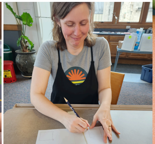
Adults learn it's okay to "take chances, make mistakes, get messy!"