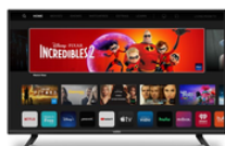
40" Smartcast TV