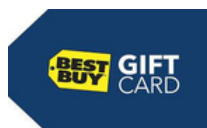
$200 Best Buy Gift Card