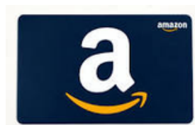
$50 Amazon Gift Card

**Prize provided by Northeast Iowa Council.