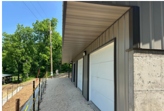
Scouts gave it two thumbs up! The new changing rooms and classroom building make camp even better!